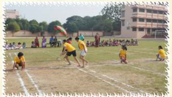
Enthusiastic Girls in Kho-Kho