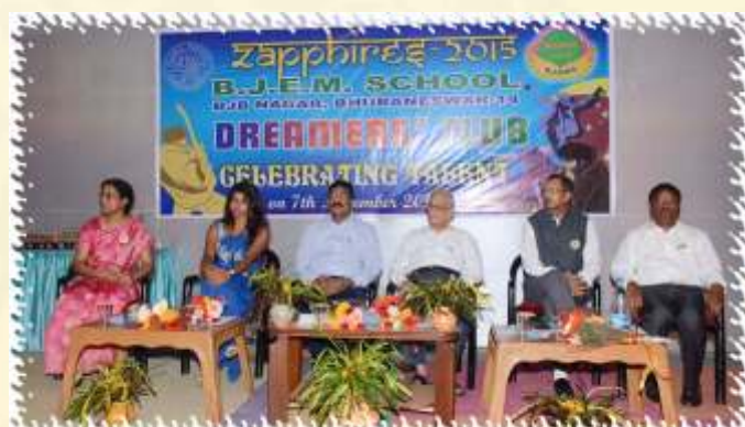
Zapphires- Dreamers' Club Annual Function-2015