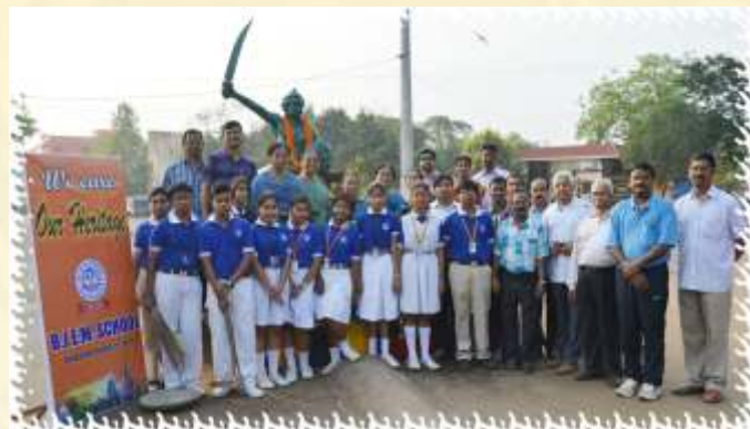
"We care our Heritage"- A cleanliness drive of statues in Smart City