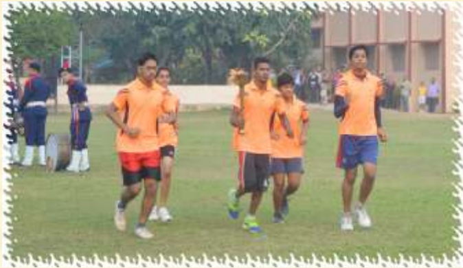
The glorious Mashaal bearers of BJEM School