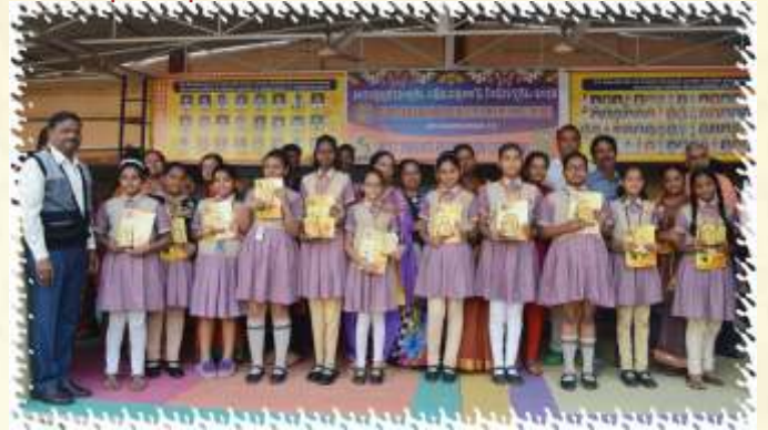
School felicitates ICF host participants and parents