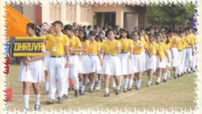
Students Marching with pride