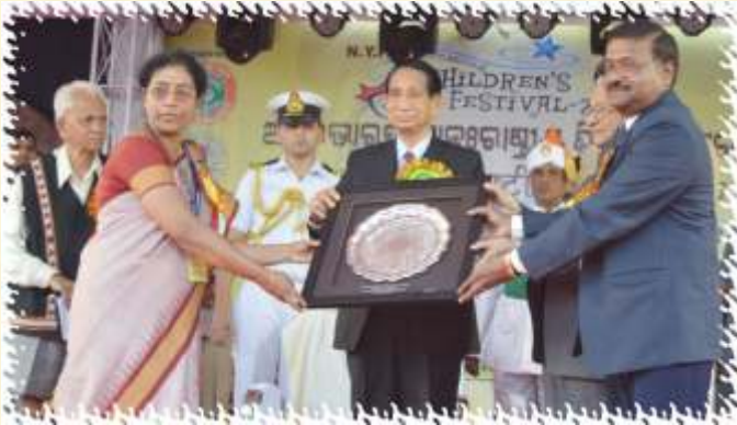
A token of love presented to His Excellency at ICF