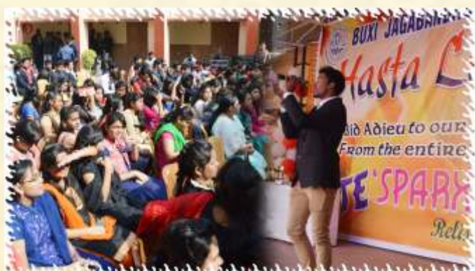
Heart filled farewell "Hasta Luego" to students of Std.- XII