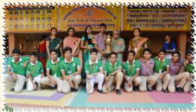
Hard work rewarded in Literary Prize Distribution Ceremony