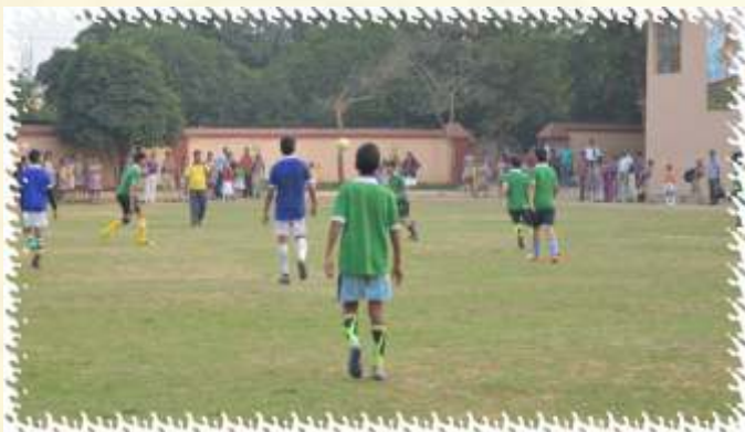
Football Team in Action