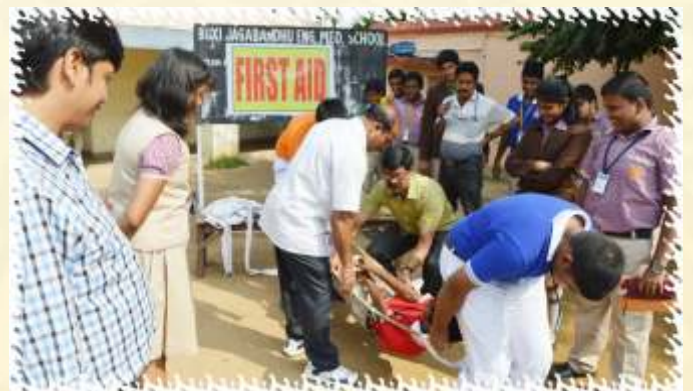
First Aid training in progress