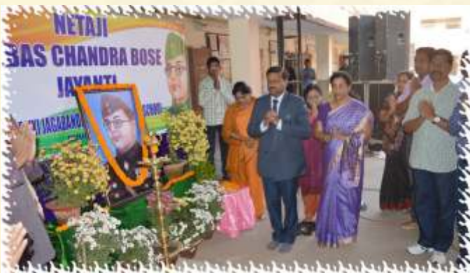
A Tribute to Netaji