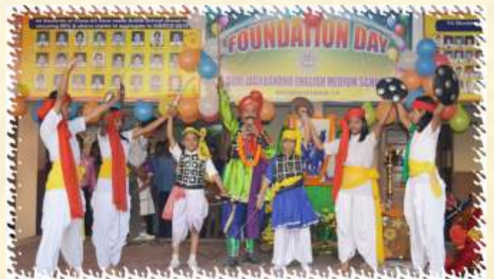
Role Play made Buxi Jagabandhu alive