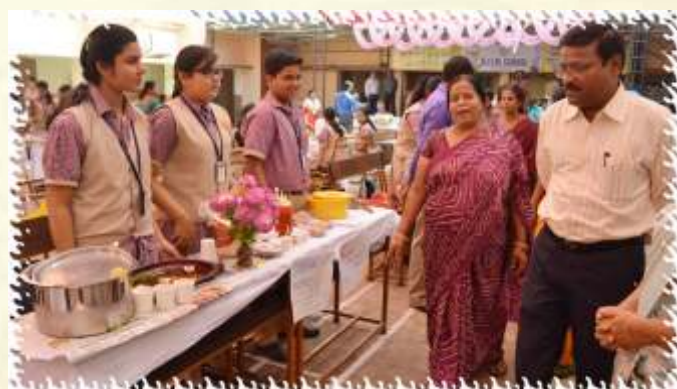
Relishing Food stuffs in FETE