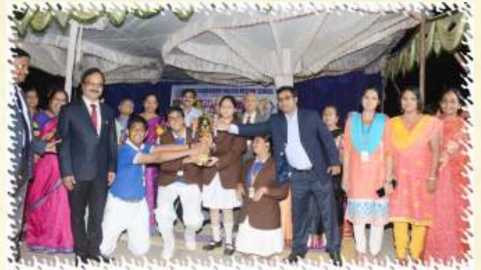
Shravan House outshines in Sports