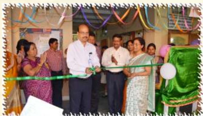
Inauguration of School FETE