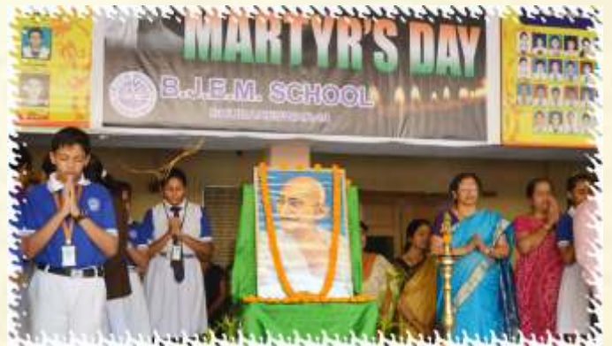
Father of the Nation remembered