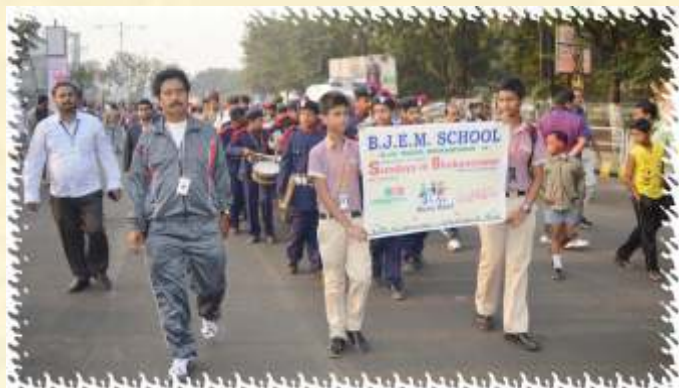
Spectacular show of School Band on the inaugural ceremony of Rahagiri Day