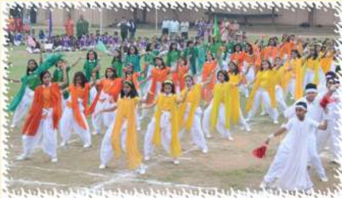
Mesmerizing Cultural programme on Sports Day