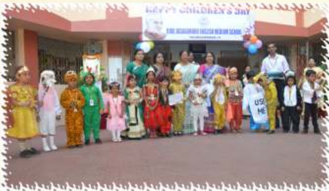
Kids Fancy Dress show on Children's Day