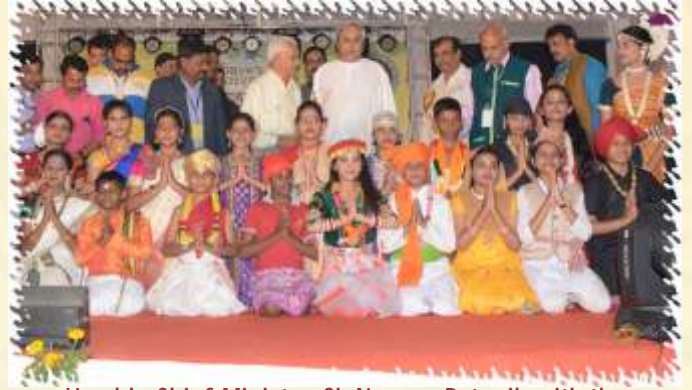
Hon'ble Chief Minister, S.J. Naveen Patnaik with the participants of Bharat ke Santan at ICF-2015