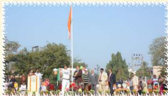
National Flag hoisted with patriotic fervour on Republic Day-2016